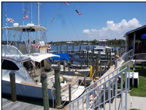
The marina has undergone an extensive make-over and is becoming a very popular location for friendly gatherings as can be seen by the pictures on the next page.....