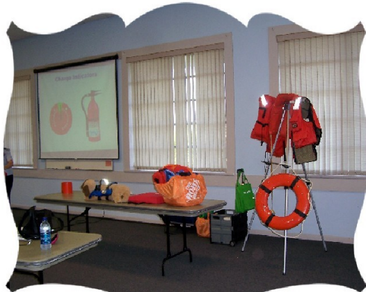
Safety Equipment for your boat