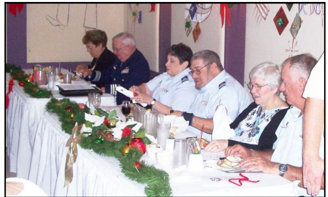
Pictured above are the members and guests of Flotilla 87 enjoying some fellowship at the Change of Watch which was held at the Englewood Elks on Tuesday, December 6th.