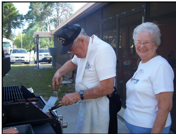
Picnic photos by Skip Wilson