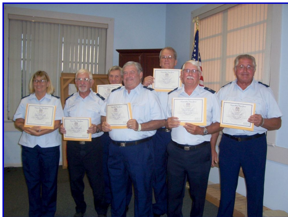
New members from left to right: