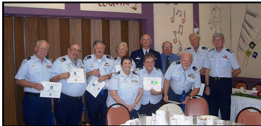
Outgoing 2013 Officers