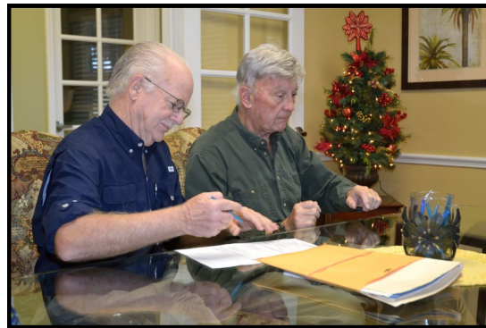
Paperwork completed. Signed, sealed and "ours"!