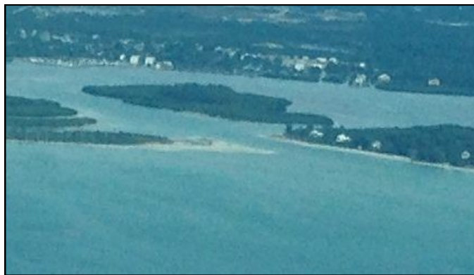
A closer look at Stump Pass