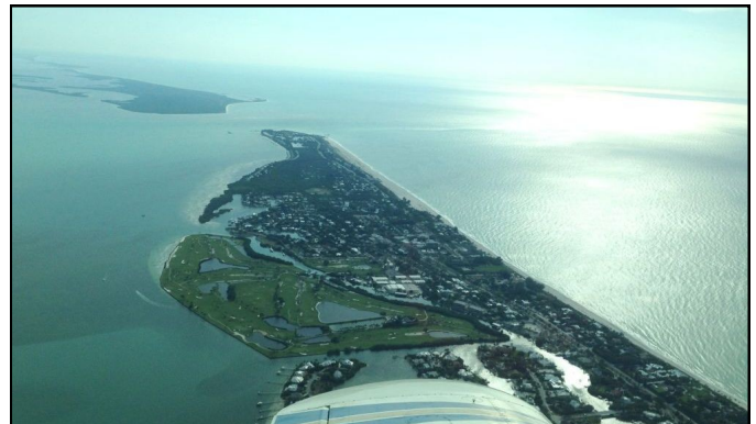
Southern end of Gasparilla Pass