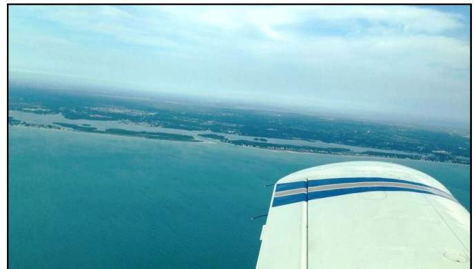
Stump Pass in Englewood