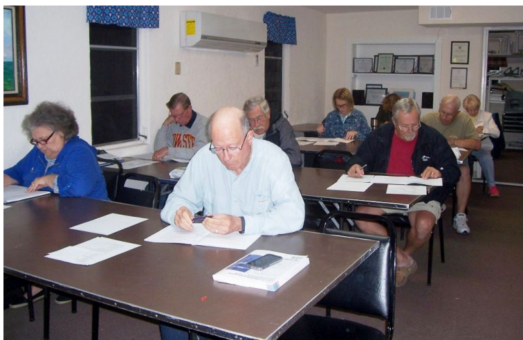
Students taking the final exam